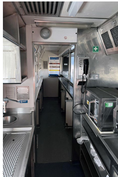
Buffet coach catering area