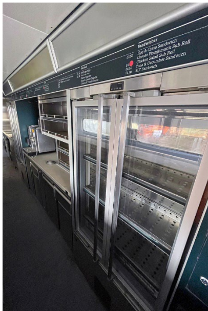
Buffet coach catering area