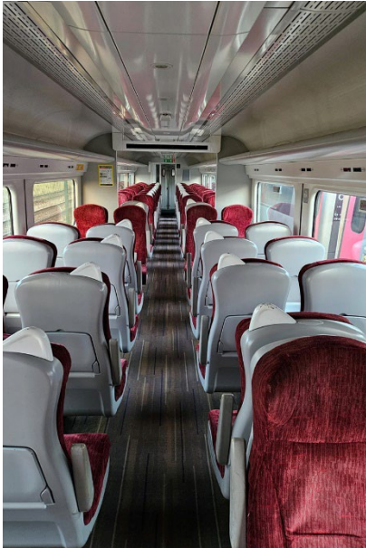
Standard class accommodation