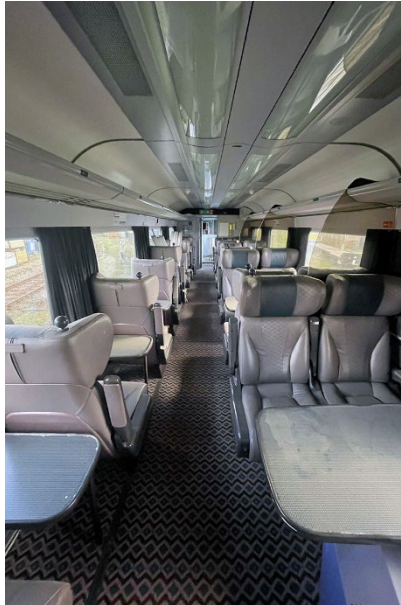
First class accommodation