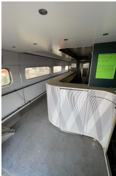
Buffet coach counter area