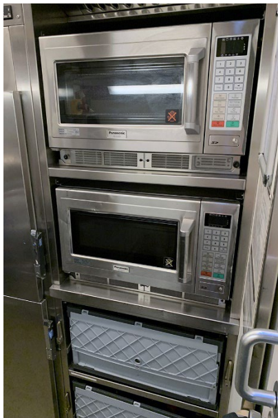
Buffet coach catering area