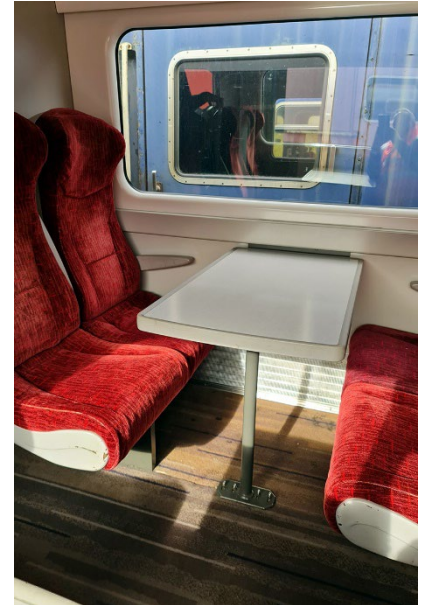
Standard class accommodation